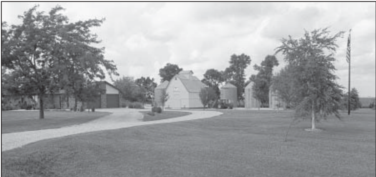
The Reigelsberger farm, south side, Section 12, Roosevelt Township, 1990. The corncrib in the center has been razed, and a new pole building for machine storage has been built at the right behind the small tree.

Joe's family had been Republicans until they switched to the Democratic party in 1932 when Roosevelt promised a farm program. Corn had been selling at 8 to 12 cents a bushel, but the first time they sealed their corn (i.e., obtained a government loan against the corn while storing it on the farm) under the new program, the price per bushel went up to 33 cents.