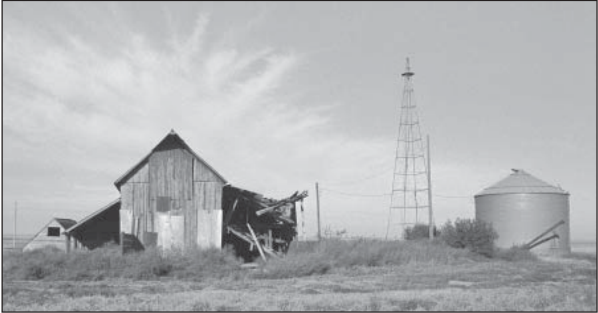
The Brinkman farm, north side of Section 18, Garfield Township, 1989.