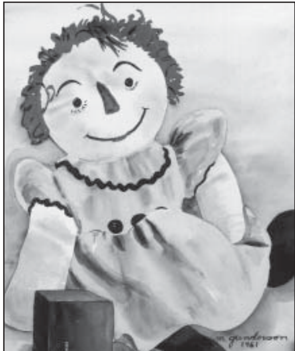
Raggedy Ann doll, 1961.