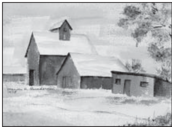
Gunderson farm, 1975.