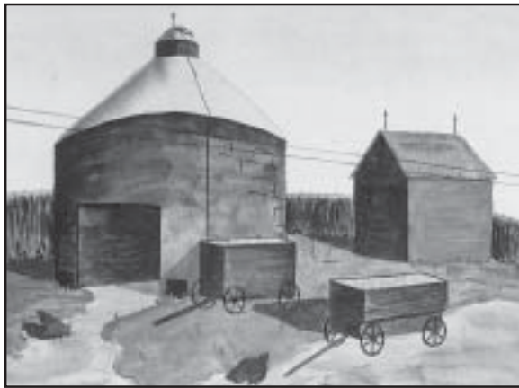
Gunderson farm, 1948.