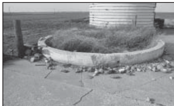
Farm "ruins" at the west end of road, including a feedlot pump, rolls of barb wire, tin, and the foundation of a silo, 1989. The place is now completely cleared and tilled for corn and soybeans.