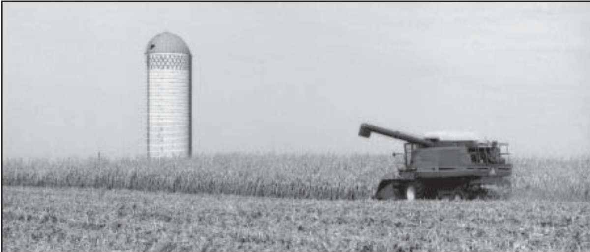
Above: Paul Harrold harvests corn at the westernmost farm. Southwest corner, Section 9, Roosevelt Township, 1994. Below: A warning sign for a dirt road that was the last section of the road, 1995.

Sometimes, when I was growing up, the farm at the west end of the road was inhabited, sometimes it was not. The school bus didn't always go there, and when it did, it had to travel a mile on a dirt road that was sometimes muddy and treacherous with a bend at the end where the farmsite sat in a large grove of trees. It seemed like a dead end but was only a T-intersection. When the road conditions were questionable, John Hopkins, the school bus driver, would edge the bus to the beginning of that dirt road, peer ahead, and discern whether to take that road or go around the entire section to get to the farm. The kids on the bus would get caught up in the decision and cheer when Hoppy would forge ahead, taking the direct route on the questionable road and making our ride to school shorter.