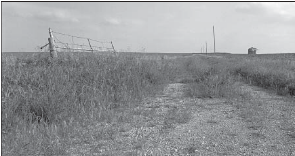
The gate and lane at the Shimon farm with grain bins in the distance, 1994.