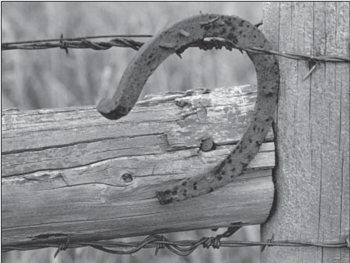
A horseshoe on a fence post near the entrance to the field where the Grant building site used to be, 1994.